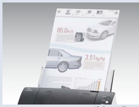
A3 Carrier Sheets

* Carrier Sheets (5 sheets per set) can be purchased separately. (The Carrier Sheet should be replaced approximately every 500 scans)