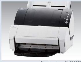
Post Imprinter (fi-718PR)

The optional imprinter unit prints identification markers like dates, alphanumeric codes and symbols on reverse side of the original document. This makes it easier to locate the originals of scanned document when you need to reference them.