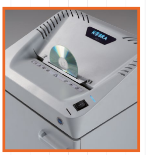
AUTOMATIC START & STOP automatic start and stop through electronic eyes with stand-by function. Integrated flap for CDs, DVDs, floppy-disks and credit cards shredding

ENERGY SMART* Power management system with illuminated indicators for power saving in stand-by mode. Easy to operate On-Off-Reverse switch, with LED signal for bag full and/or open door