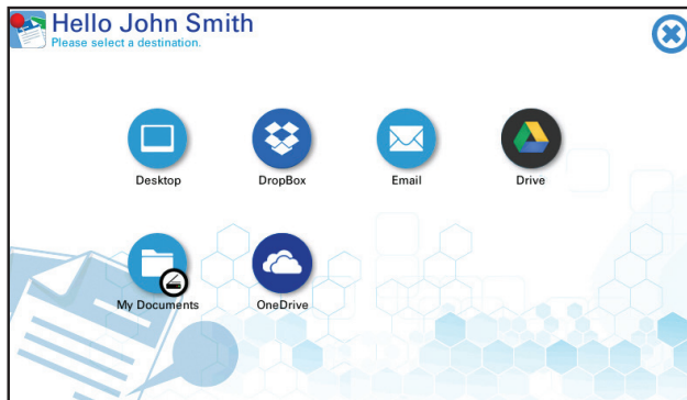
Easy access to PinPoint Scan 3 destinations from the MFP control panel