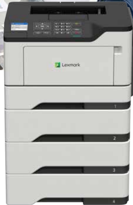
MS521dn with optional trays